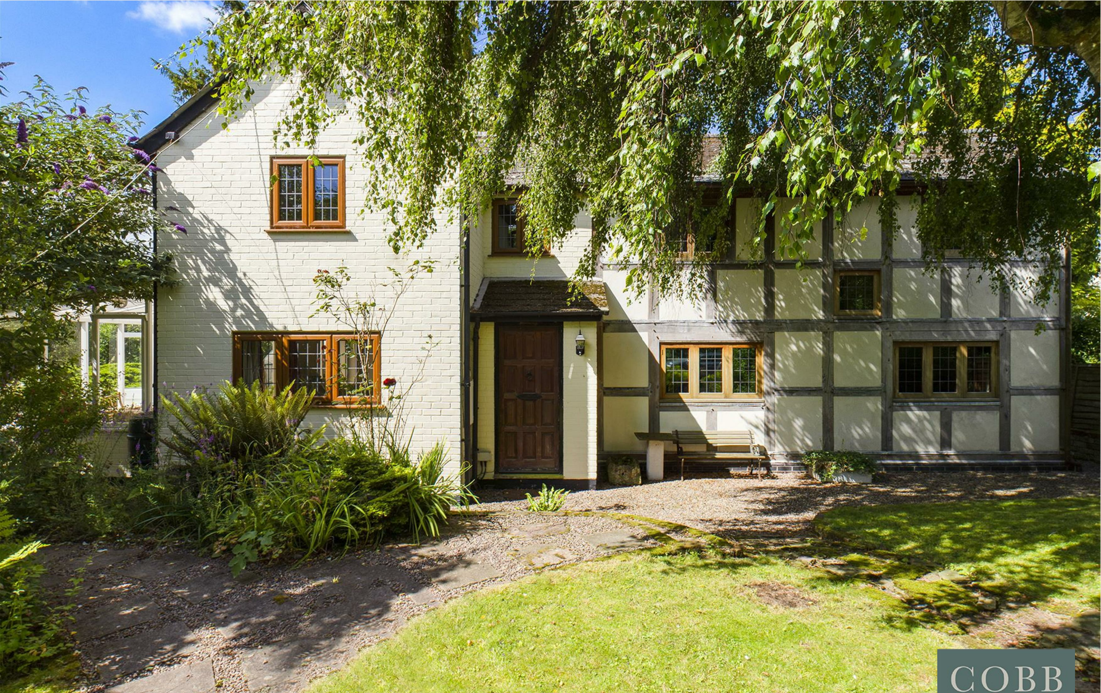
Cartref, Ivington Green, HR6 0JN Price £490,000