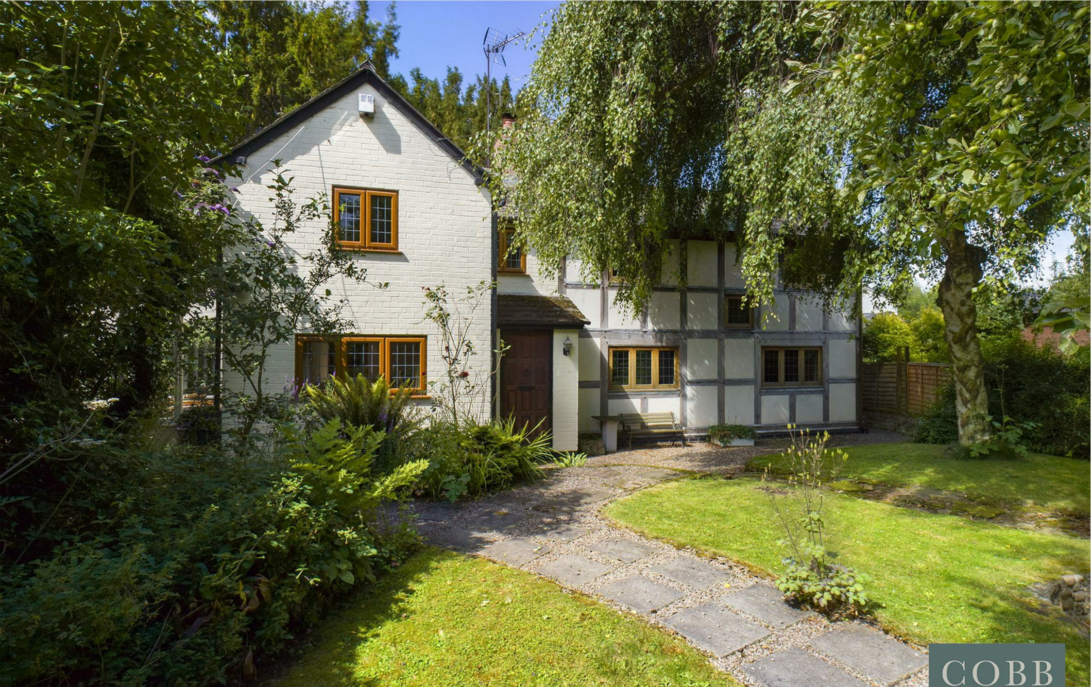
Cartref, Ivington Green, HR6 0JN Price £490,000