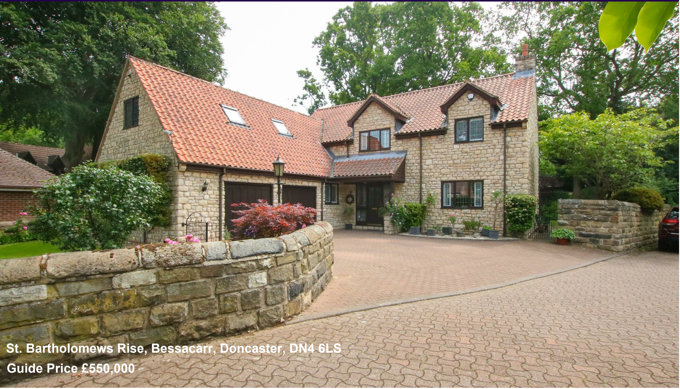
St. Bartholomews Rise, Bessacarr, Doncaster, DN4 6LS Guide Price £550,000