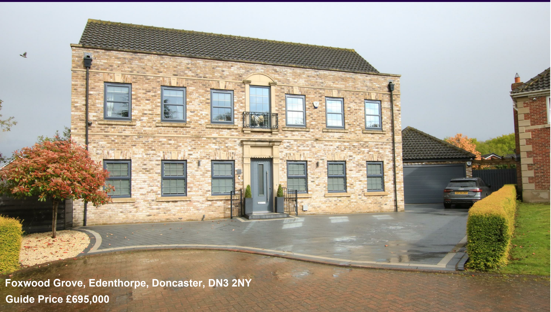
Foxwood Grove, Edenthorpe, Doncaster, DN3 2NY Guide Price £695,000