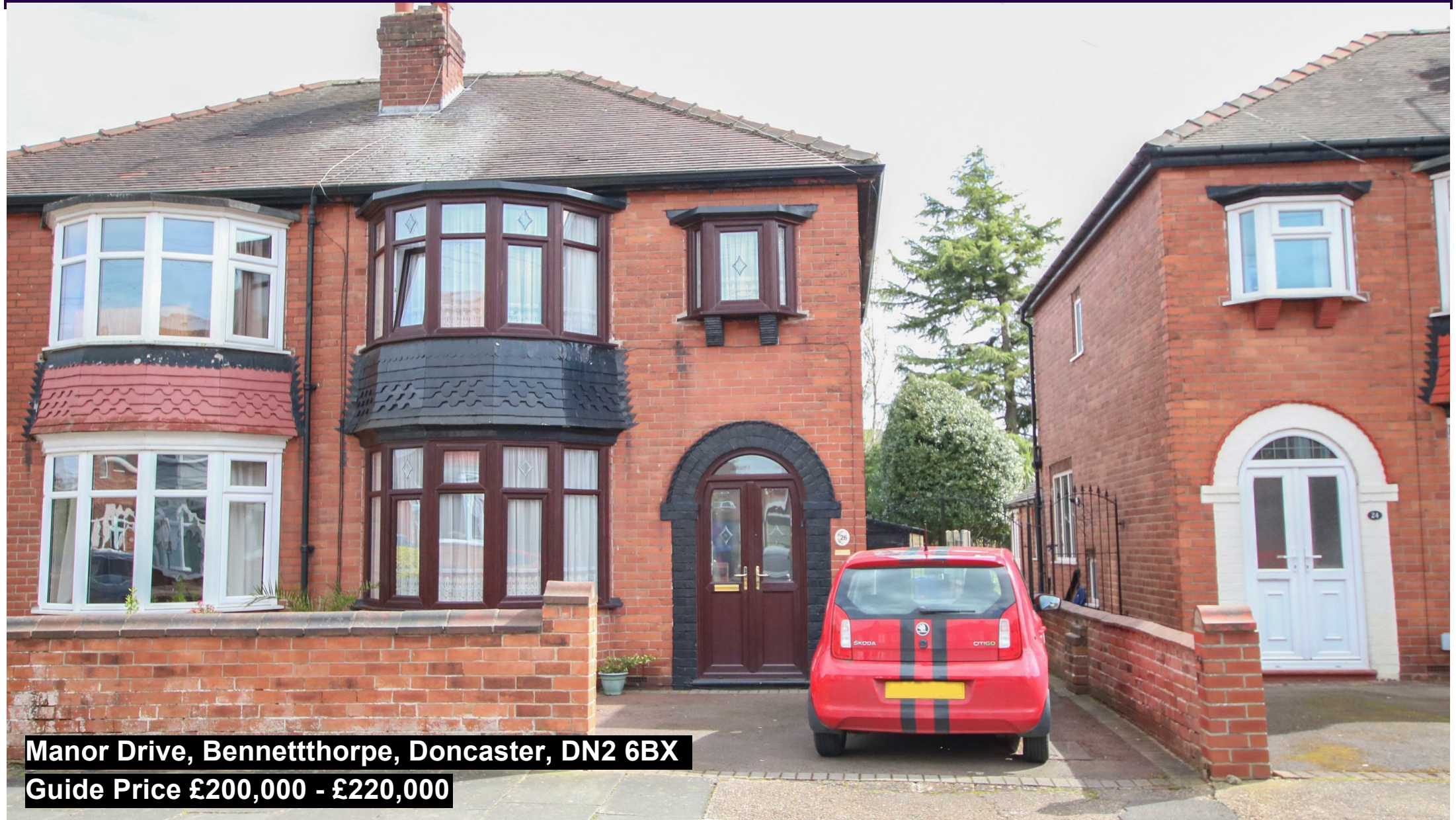
Manor Drive, Bennetthorpe, Doncaster, DN2 6BX Guide Price £200,000 - £220,000