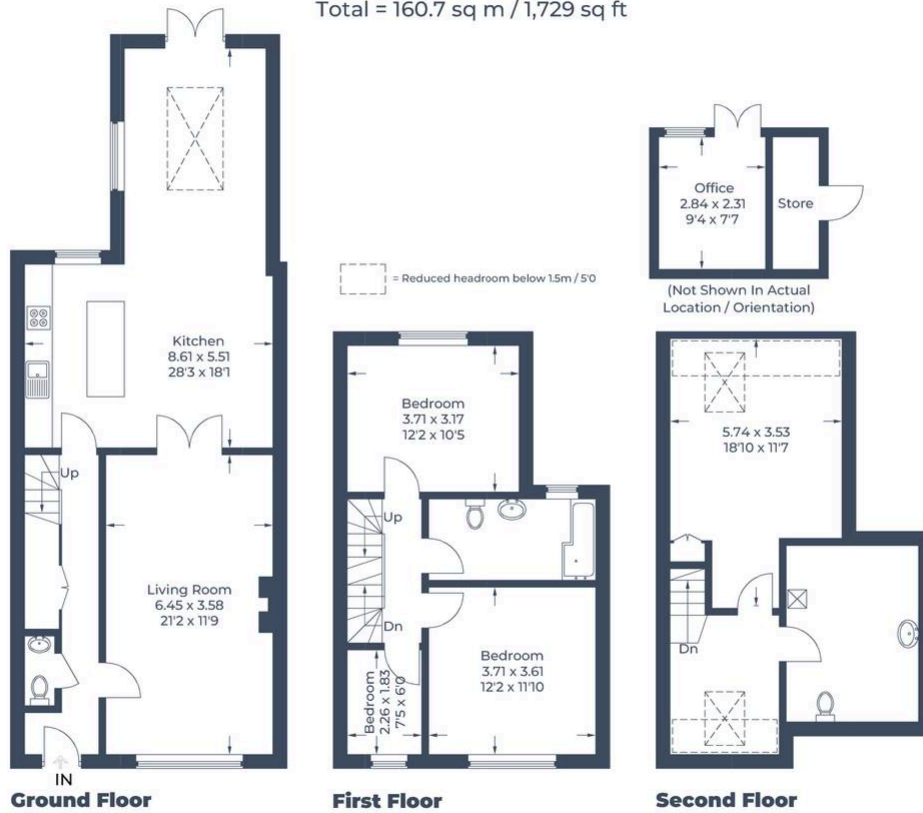
Illustration for identification purposes only, measurements are approximate, not to scale. © CJ Property Marketing Produced for Trend & Thomas