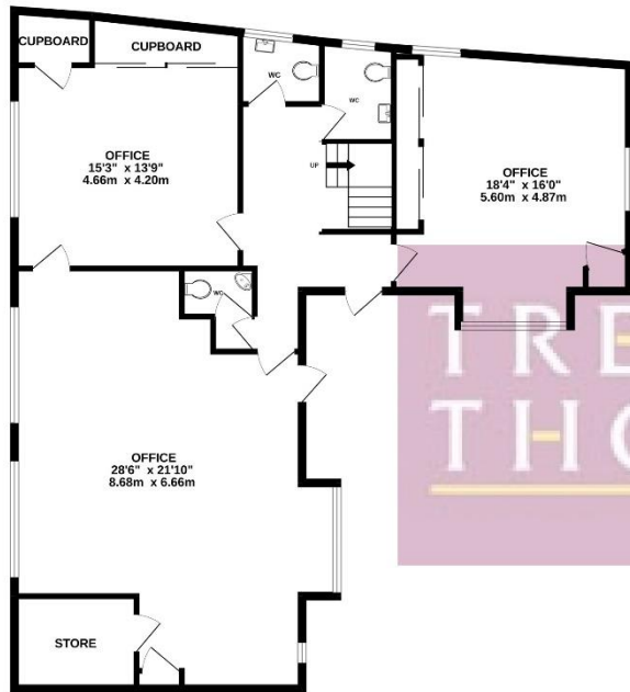
GROUND FLOOR 1270 sq.ft. (118.0 sq.m.) approx.