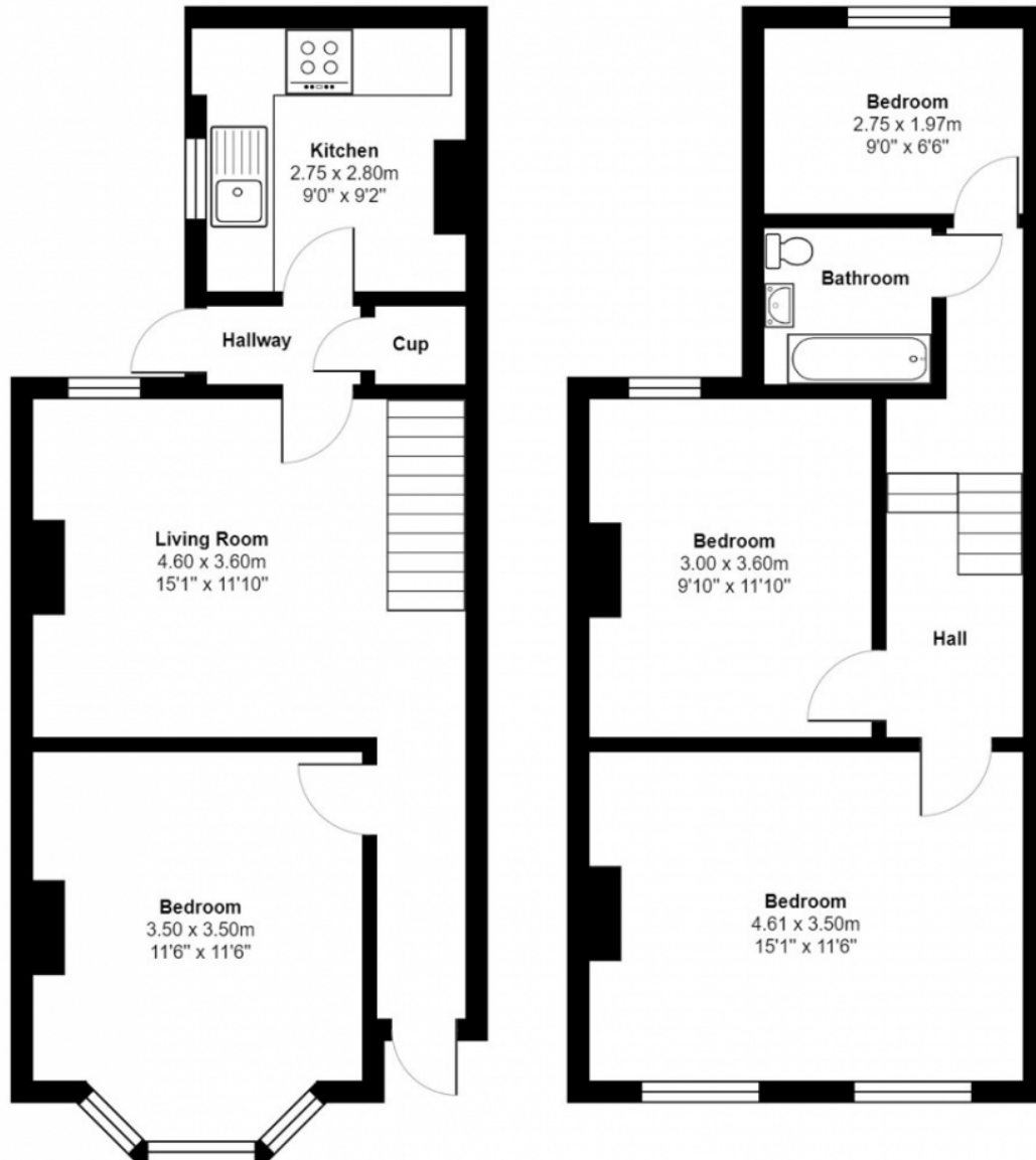
Illustration for identification and guidance purposes only. Not drawn to scale unless stated. Whilst every care is taken in the preparation of this plan please check all dimensions Assessmenthive.co.uk

Approximate Gross Internal Area = 89.0 m 2 ... 958 ft 2