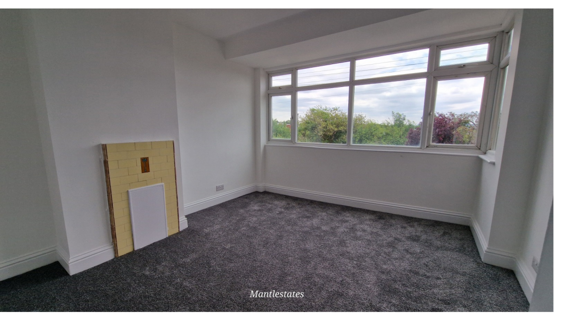
Mantlestates are pleased to present this newly refurbished, 3 bedroom, End of Terrace house. Well located to East Barnet schools, East Barnet and Cockfosters shopping facilities, Transport links and Parks. The property is available now. New lawn to be laid.