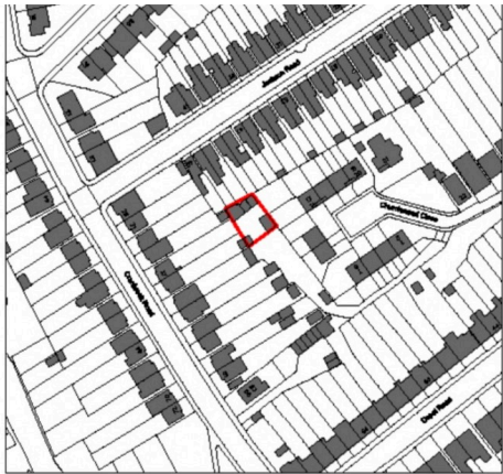
Site location plan Scale 1:1250 @ A3