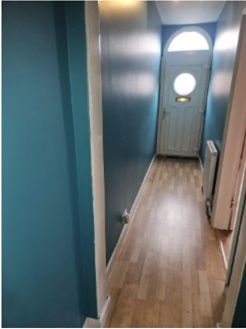
REF. 8929 64, COLVILE ROAD, WISBECH