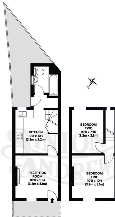
QUEENS TERRACE COTTAGES, HANWELL W7 TOTAL APPROX. FLOOR AREA: 516 SQ.FT (47.9 SQ.M)

THIS PLAN IS FOR ILLUSTRATIVE PURPOSES ONLY. WHILST EVERY ATTEMPT HAS BEEN MADE TO ENSURE THE ACCURACY OF THE FLOOR PLAN CONTAINED HERE, MEASUREMENTS OF DOORS, WINDOWS, ROOMS AND ANY OTHER ITEMS ARE APPROXIMATE AND NO RESPONSIBILITY IS TAKEN FOR ANY ERROR, OMISSION OR MIS-STATEMENT. THE SERVICES, SYSTEMS AND APPLIANCES HAVE NOT BEEN TESTED AND NO GUARANTEE AS TO THEIR OPERABILITY OR EFFICIENCY CAN BE GIVEN.