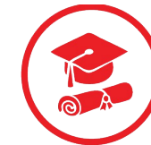
Secondary School your text here