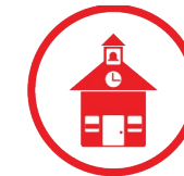
Primary School your text here