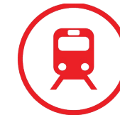
Train your text here