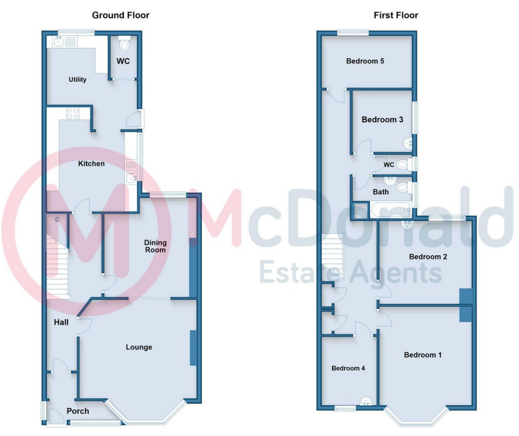
ilst every care has been taken in the preparation of these details, accuracy cannot be guaranteed. These particulars do not constitute a contract or part of a contract. Room dimensions (when shown) are approximate. Floorplans are for general guidance and are not to scale.