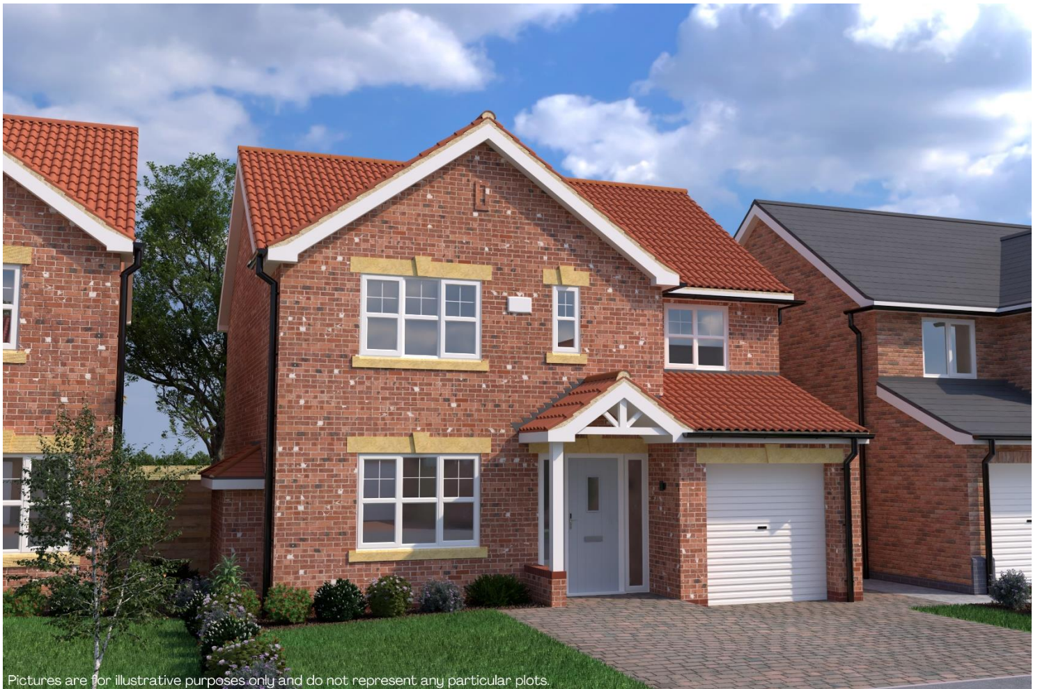
Pictures are for illustrative purposes only and do not represent any particular plots.