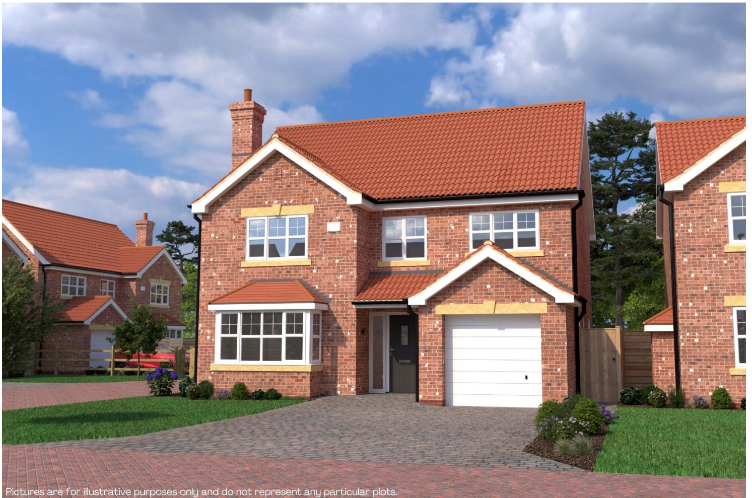
Pictures are for illustrative purposes only and do not represent any particular plots.