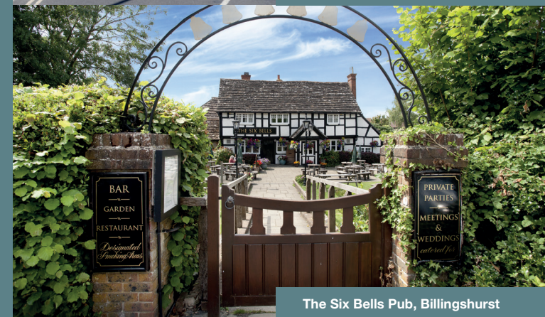
The Six Bells Pub, Billingshurst