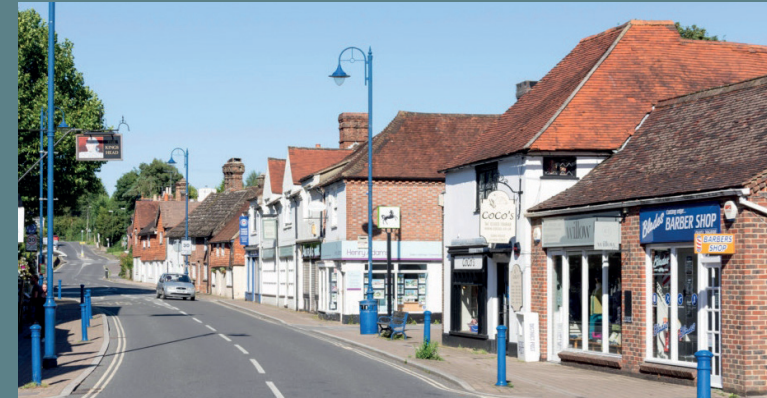
Billingshurst High Street

Billingshurst boasts excellent transport links including a direct train to London Victoria in just over one hour.