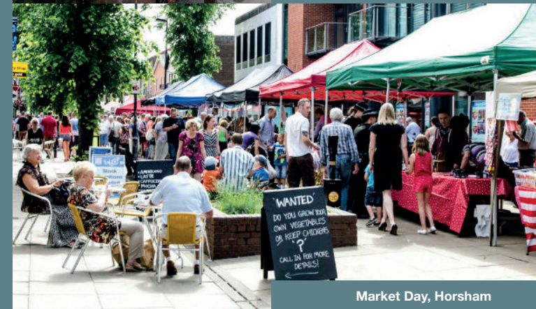
Market Day, Horsham