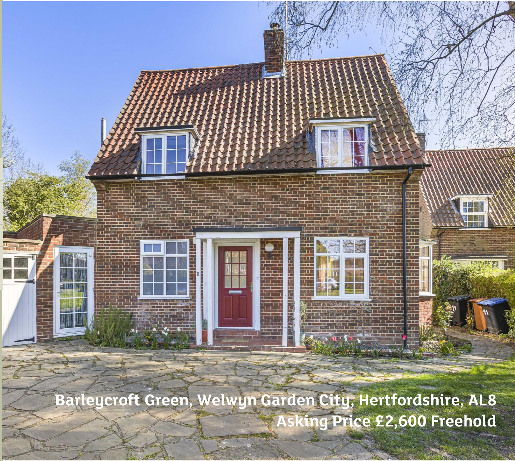
Barleycroft Green, Welwyn Garden City, Hertfordshire, AL8 Asking Price £2,600 Freehold

Deposit £3,000.00 Holding Deposit £600.00