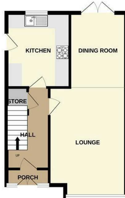
GROUND FLOOR 596 sq.ft. (55.4 sq.m.) approx.