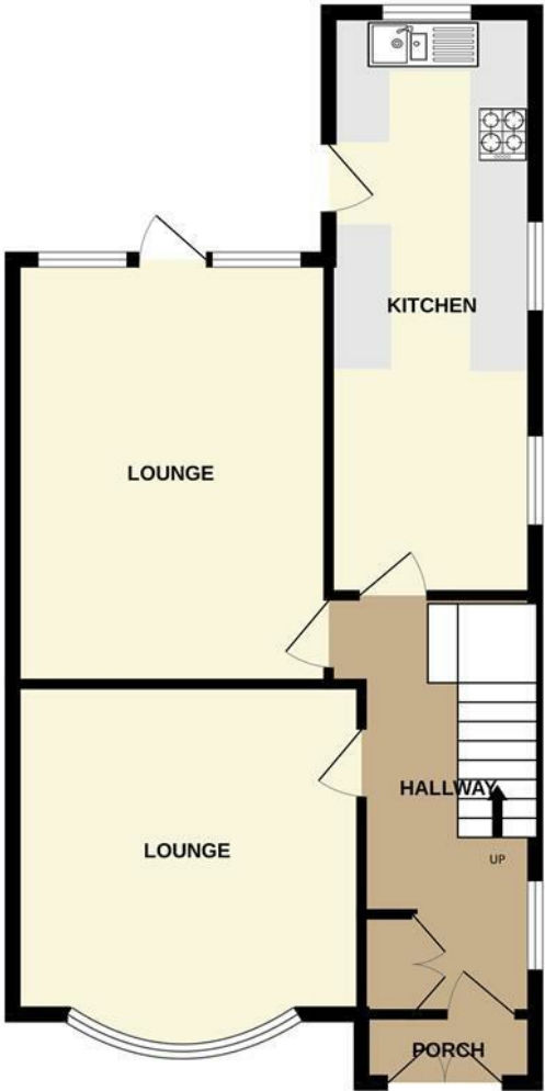
GROUND FLOOR 645 sq.ft. (59.9 sq.m.) approx.