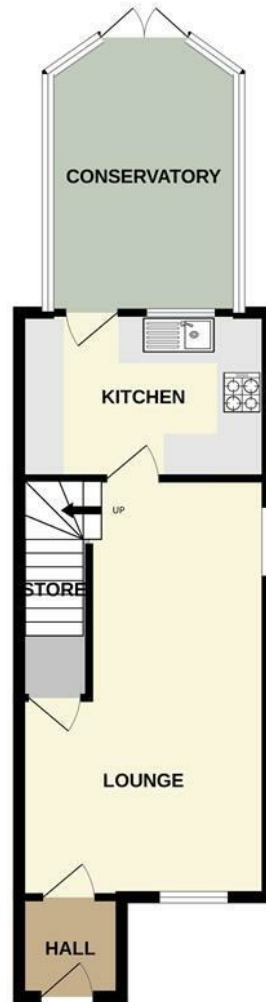
GROUND FLOOR 485 sq.ft. (45.0 sq.m.) approx.