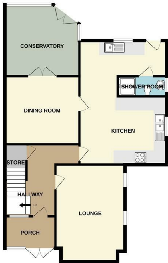
GROUND FLOOR 1209 sq.ft. (112.4 sq.m.) approx.