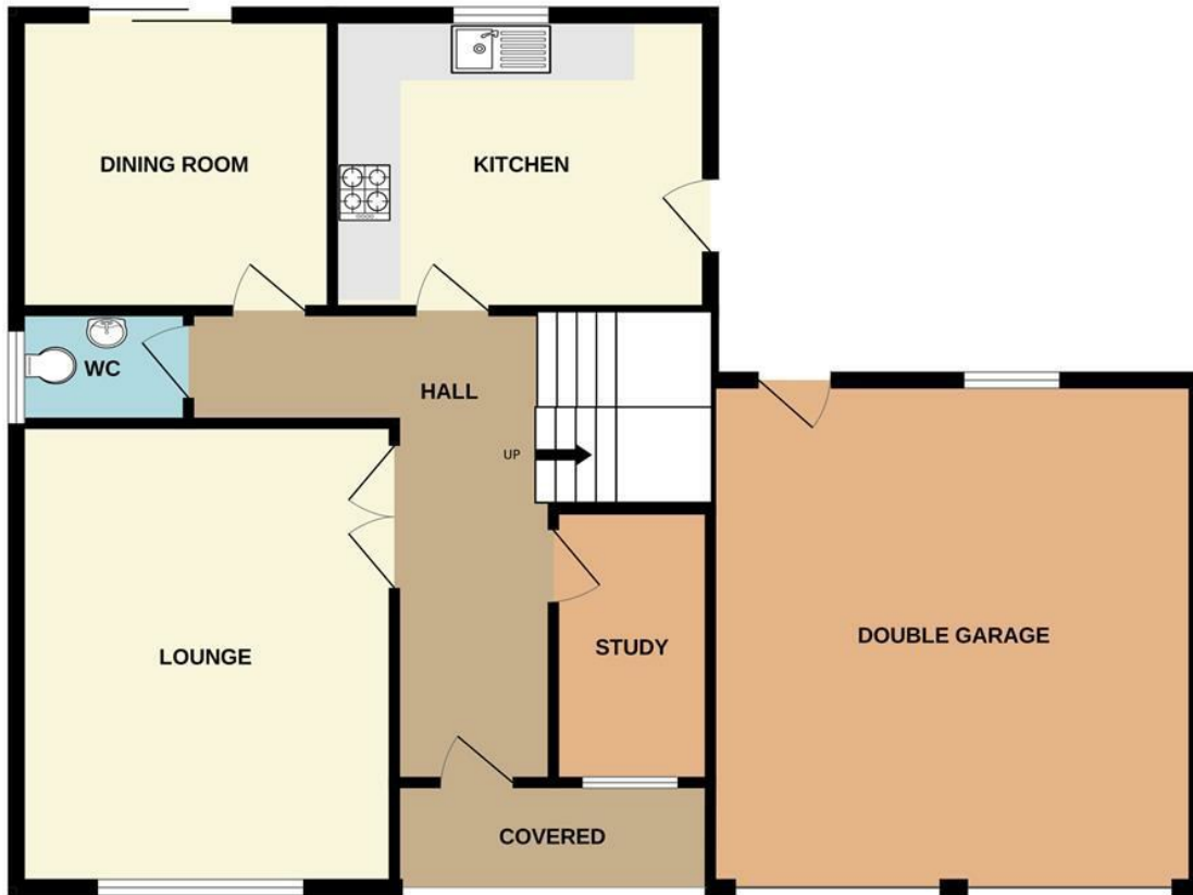
GROUND FLOOR 1023 sq.ft. (95.1 sq.m.) approx.