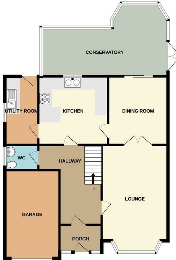
GROUND FLOOR 1089 sq.ft. (101.1 sq.m.) approx.