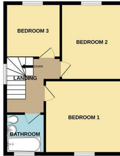
2ND FLOOR 270 sq.ft. (25.1 sq.m.) approx.