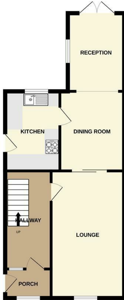
GROUND FLOOR 574 sq.ft. (53.3 sq.m.) approx.