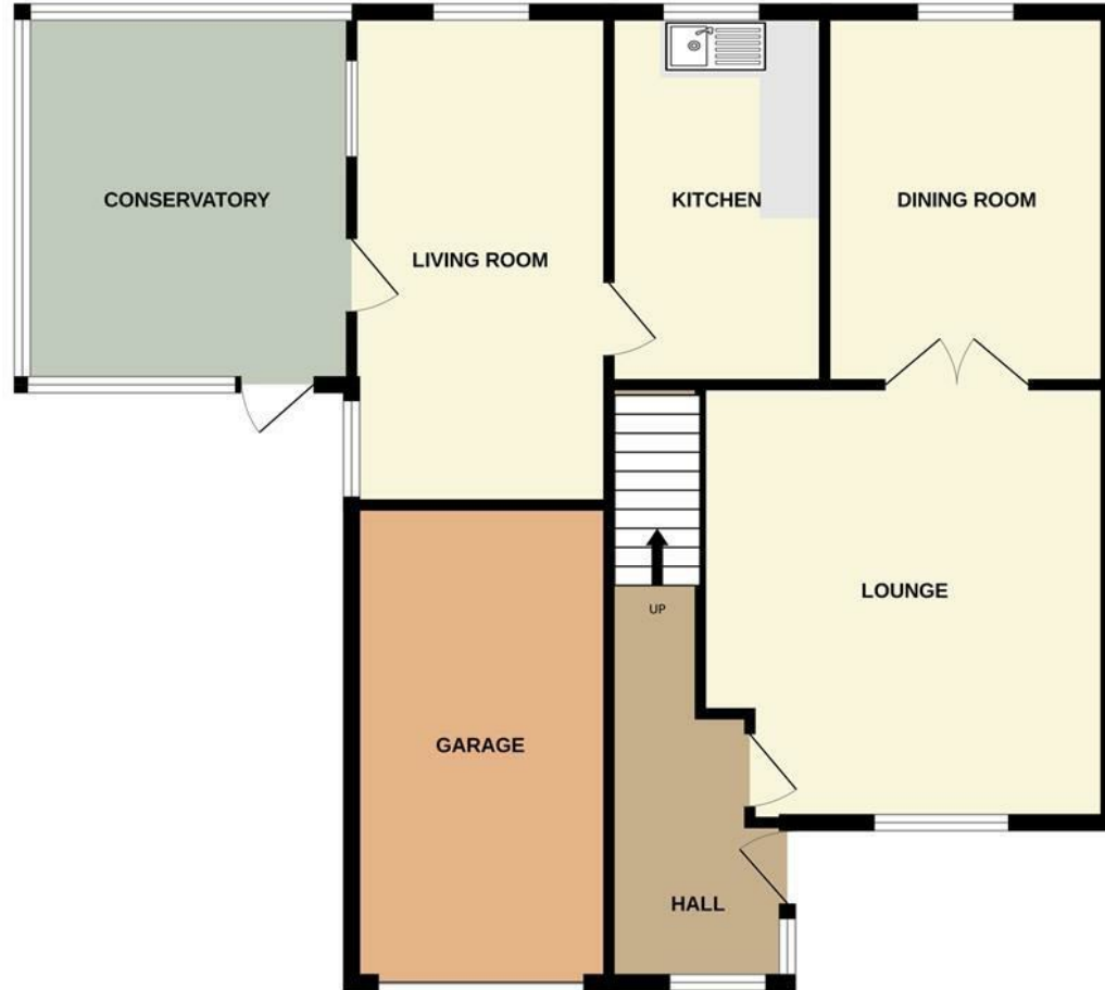
GROUND FLOOR 960 sq.ft. (89.2 sq.m.) approx.