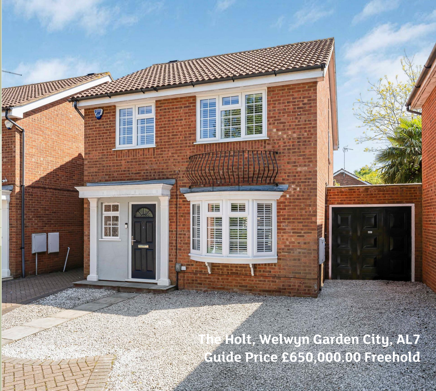
The Holt, Welwyn Garden City, AL7 Guide Price £650,000.00 Freehold

Local Authority Welwyn Hatfield Borough Council