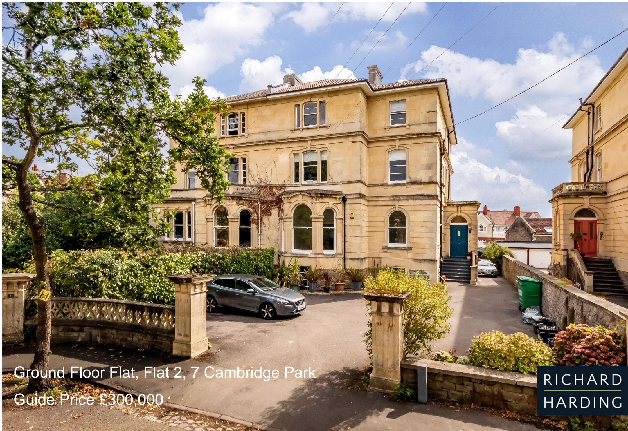
Ground Floor Flat, Flat 2, 7 Cambridge Park Guide Price £300,000