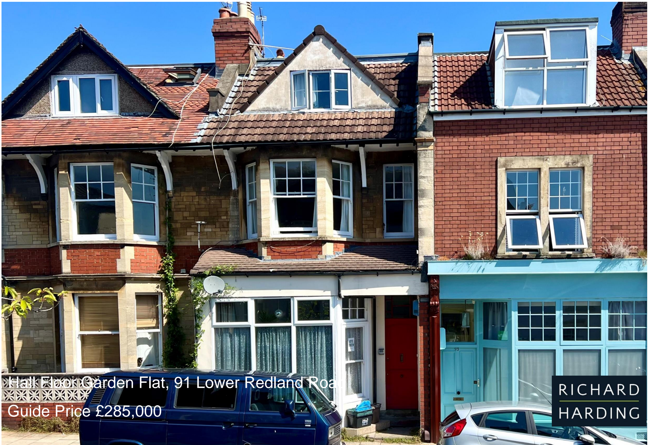
Hall Floor Garden Flat, 91 Lower Redland Road Guide Price £285,000