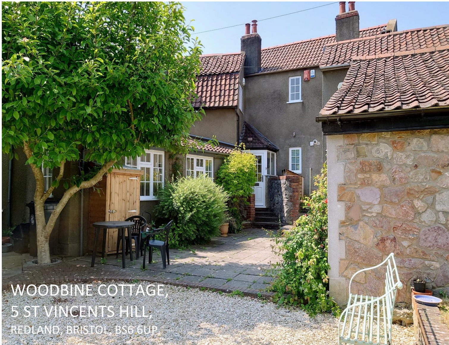
WOODBINE COTTAGE, 5 ST VINCENTS HILL, REDLAND, BRISTOL, BS6 6UP