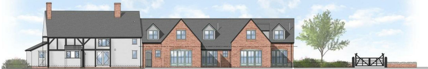
Proposed Street Scene A [Scale 1:100]