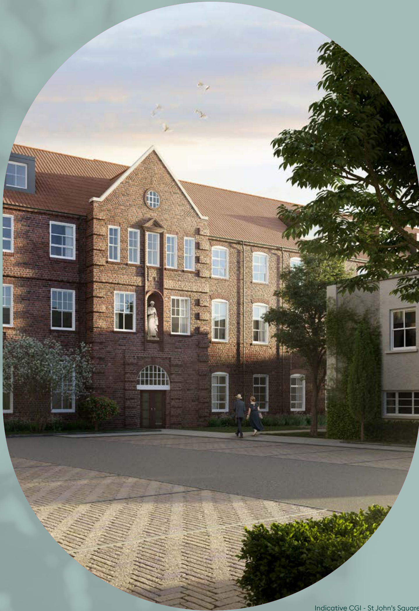
Indicative CGI - St John's Square