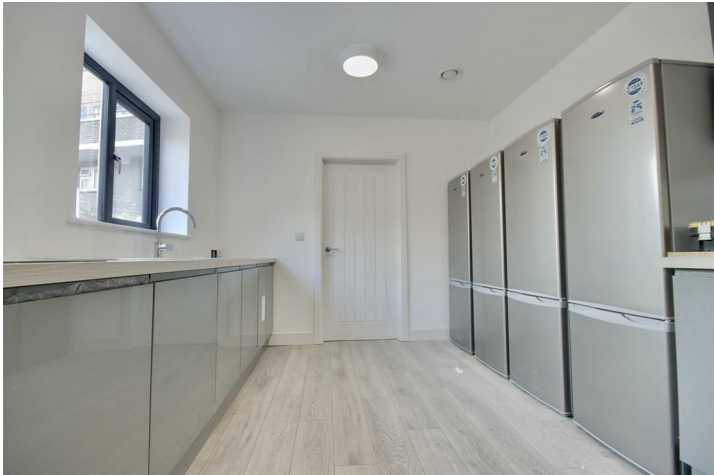
1ST FLOOR 98 sq.ft. (9.1 sq.m.) approx.