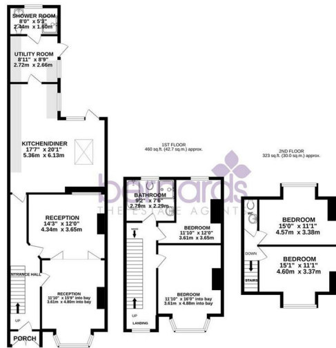
TOTAL FLOOR AREA: 1566 sq ft (144.8 sq m) approx. While every effort has been made to ensure the accuracy of the Property's contained text, illustrations, floor plans, views and any other items are presented only as representations to which no warranty, representation or statement is made. They are for illustrative purposes only and should be used as such by any prospective purchaser. The accuracy, appropriateness and applicability of these plans and illustrations are not guaranteed. See the applicable provisions in the contract. Made with Mapbox ©2024