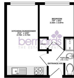
TOTAL FLOOR AREA: 128 SQ FT (11.91 SQ METERS)