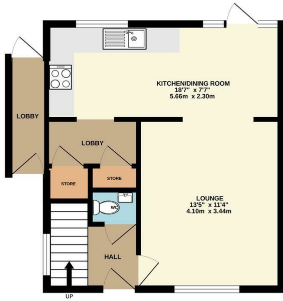
GROUND FLOOR 418 sq.ft. (38.8 sq.m.) approx.