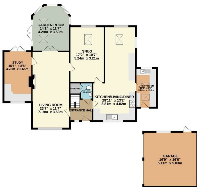
GROUND FLOOR 1491 sq.ft. (138.5 sq.m.) approx.