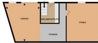
ANNEX GROUND FLOOR 648 sq.ft. (60.2 sq.m.) approx.