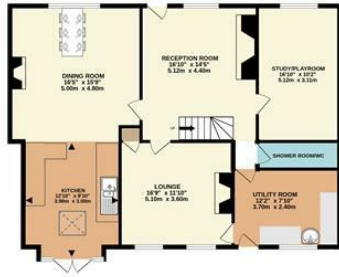
GROUND FLOOR 1167 sq.ft. (108.4 sq.m.) approx.