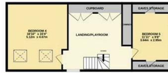
2ND FLOOR 690 sq.ft. (64.1 sq.m.) approx.