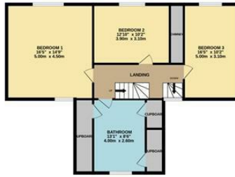
1ST FLOOR 895 sq.ft. (83.1 sq.m.) approx.