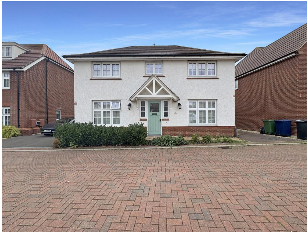
Mead Avenue, Hauxton