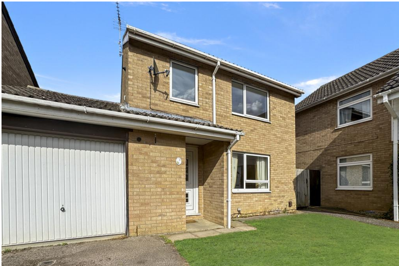
Kirbys Close, Over