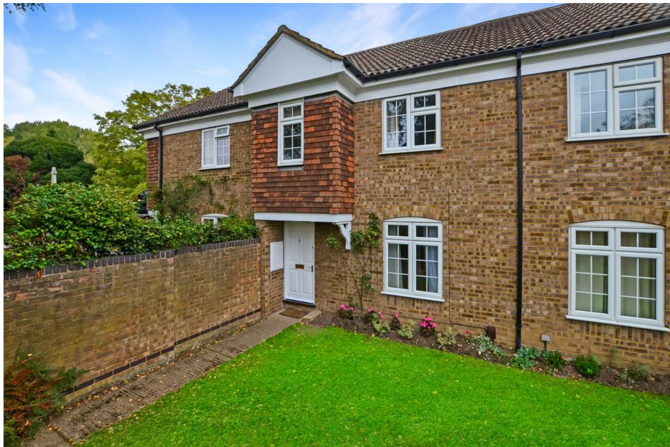
Gayton Close, Trumpington