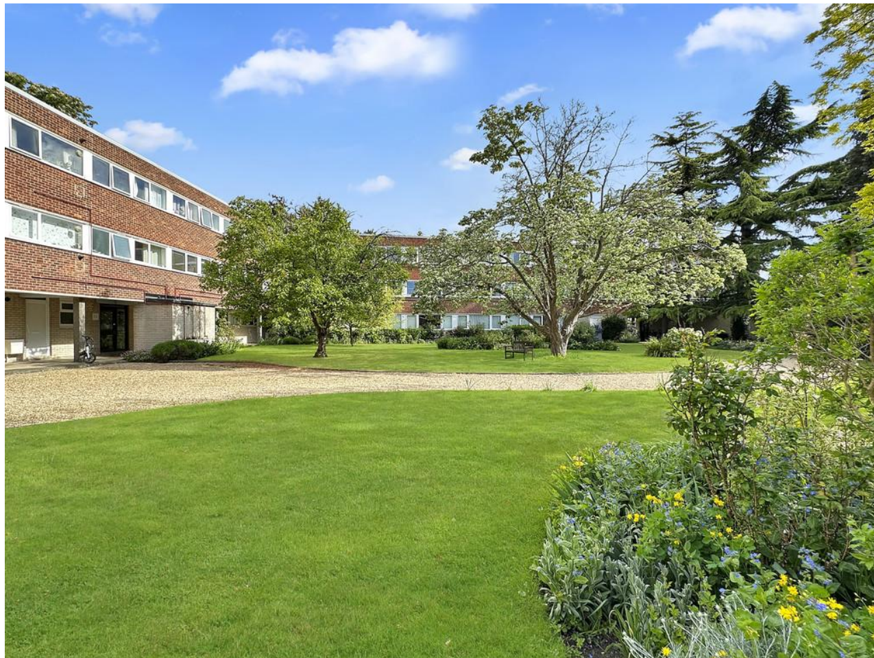
Gilmerston Court, Cambridge