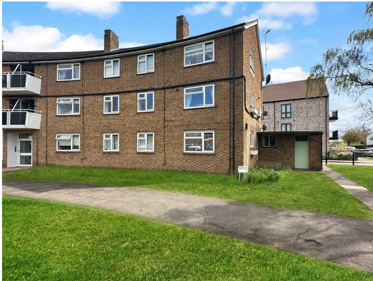
Anstey Way, Cambridge