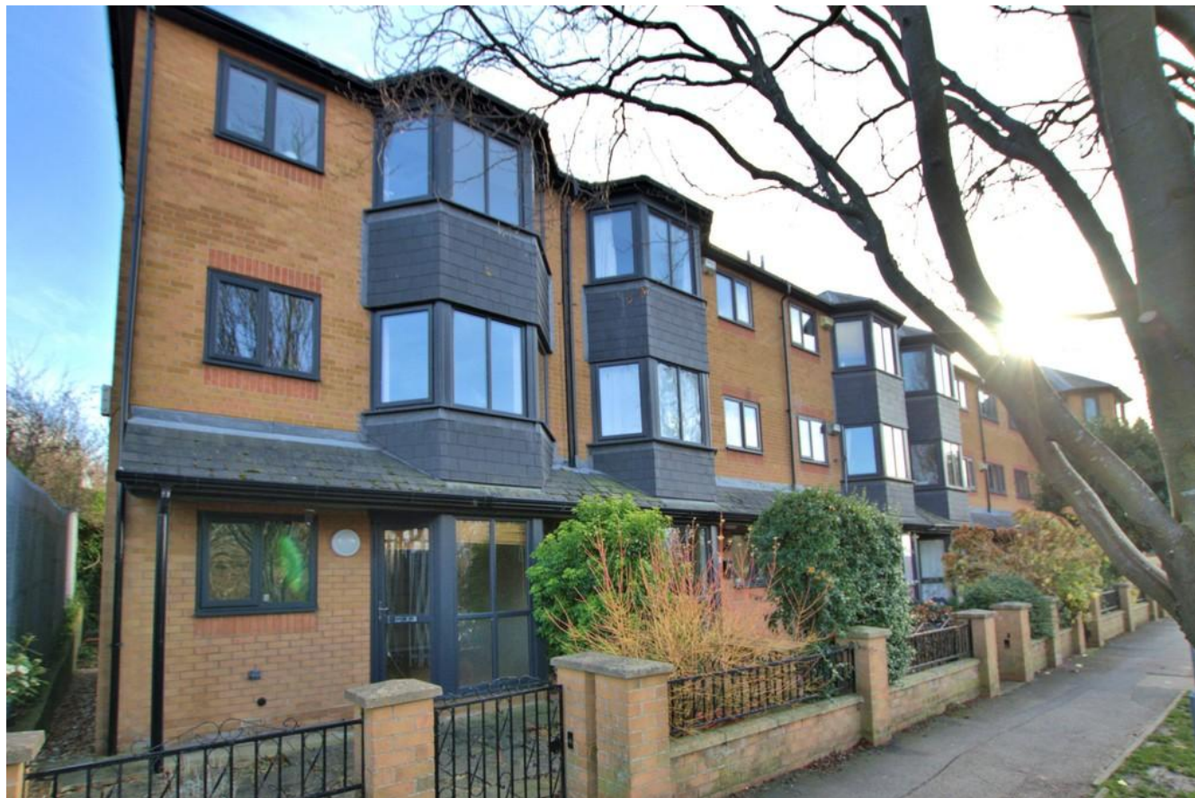
The Mallards, River Lane