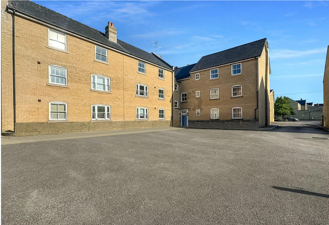
Winfarthing Court, Ship Lane, Ely