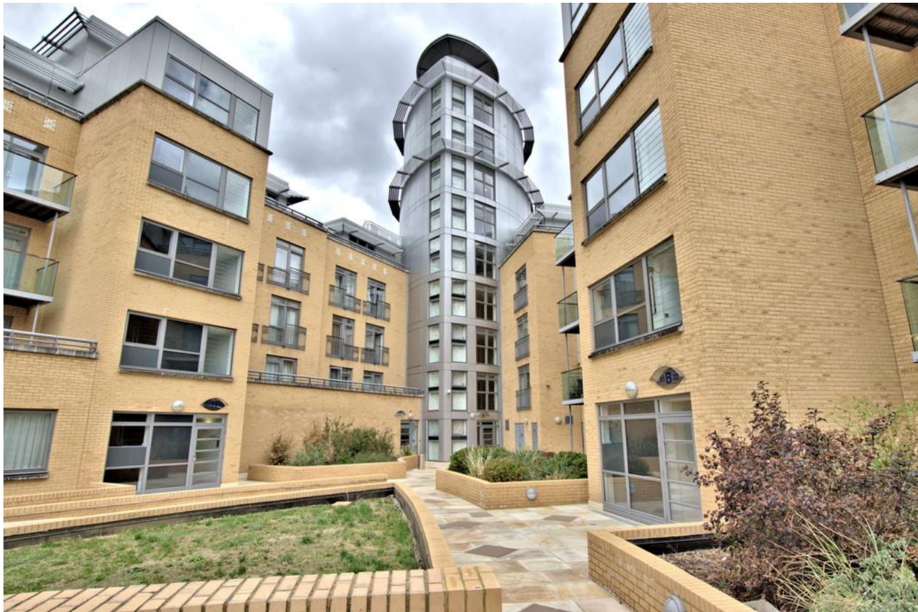
The Belvedere, Homerton Street