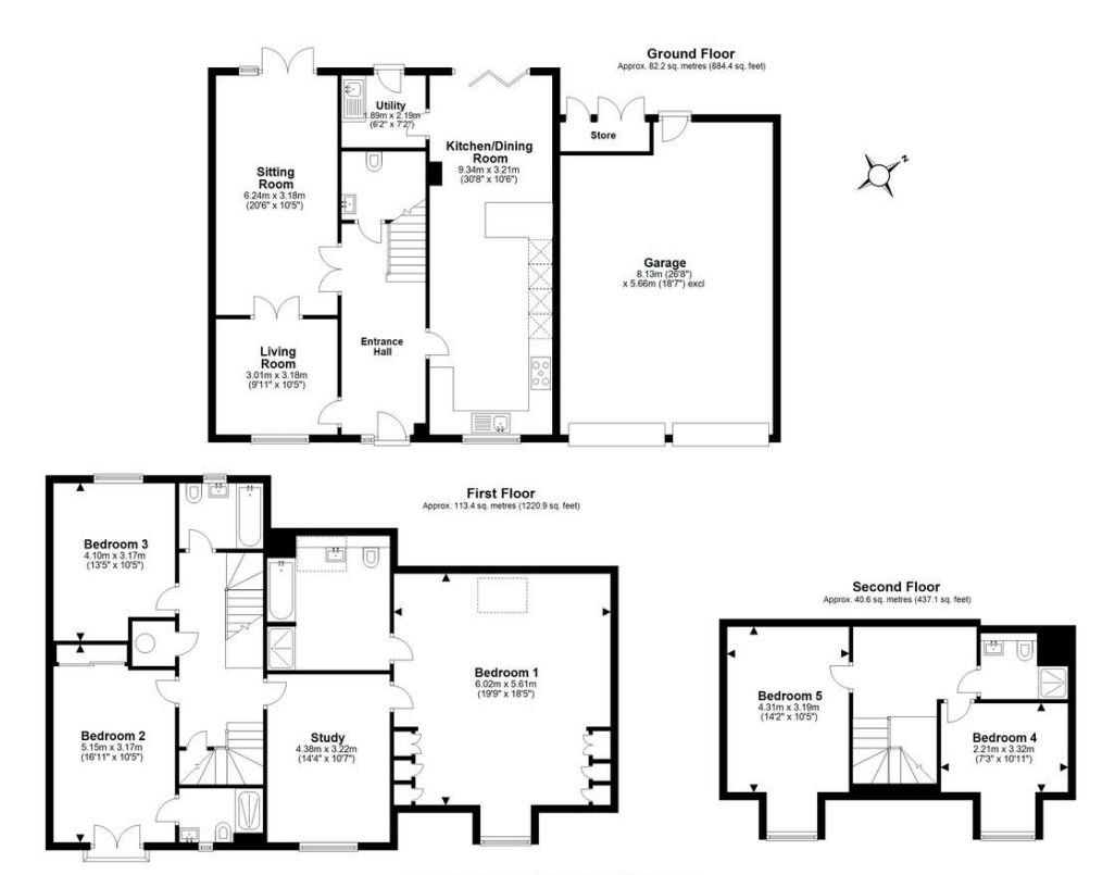
Total area: approx. 236.2 sq. metres (2542.4 sq. feet) Drawlings are for guidance only. www.beachenergy.co.uk - IPMS 2 Plan produced using Plantily.