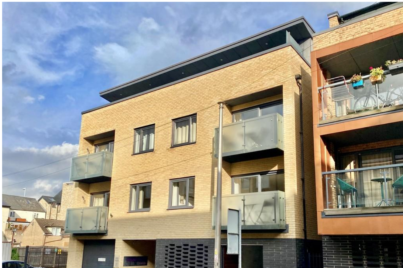
Occupation Road, Cambridge