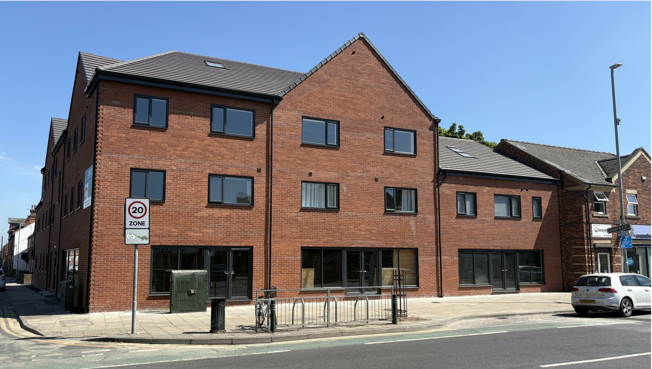
Carlton Apartments, Jackson Street, Goole, DN14 6DG £525 PCM